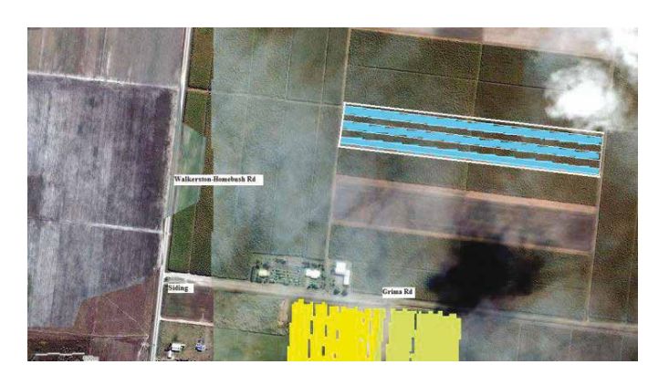
Satellite image of the trial site. Plots highlighted in blue are the Bio Dunder application plots.

The site selected was a flood-irrigated crop of 3R Q208 cane blocks. The trial area consisted of five plots: three for Bio Dunder treatments and two for granular treatments. Total area for the trial was approximately four hectares.