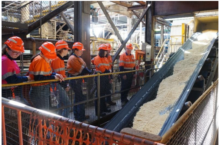
Ayr State High School girls watch raw sugar go up the belt at Pioneer Mill.