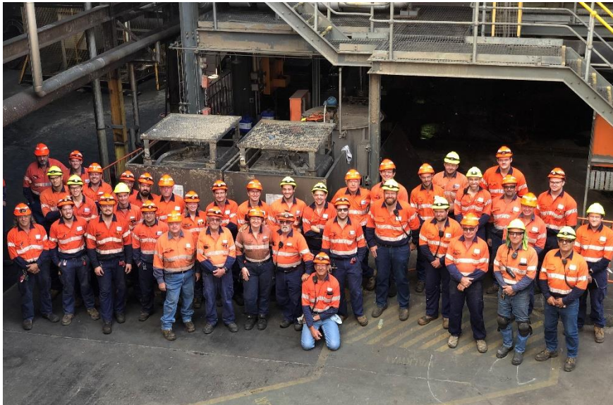
CAPTION: The team of skilled Wilmar employees who banded together to repair the fire-damaged Pioneer Mill – four days earlier than forecast.

“We’d like to thank all Burdekin growers, harvesting contractors, external contractors and our people for pulling together to get through this challenging time.”